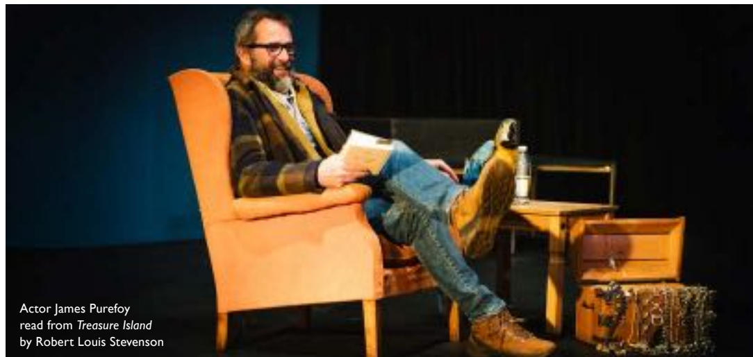
Actor James Purefoy read from Treasure Island by Robert Louis Stevenson