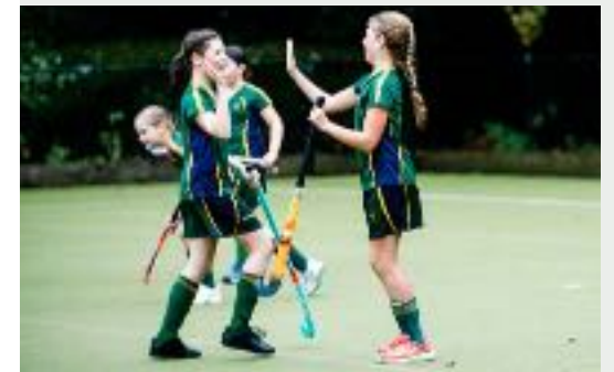
Hockey: U10 v Lewiston