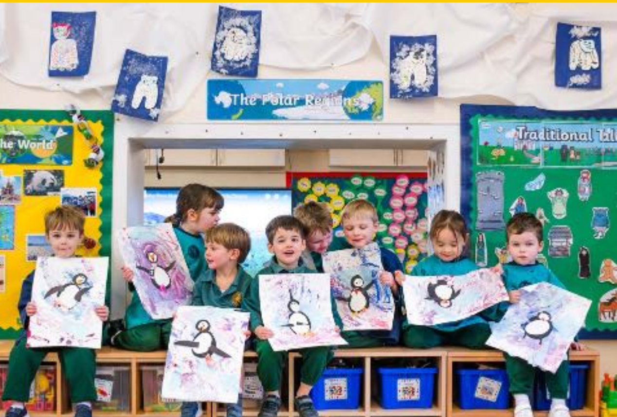
Polar explorers Nursery use art to learn about the polar region.