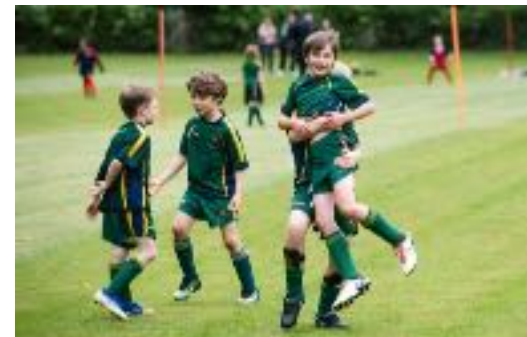
Football: Perrott Hill v Sherborne