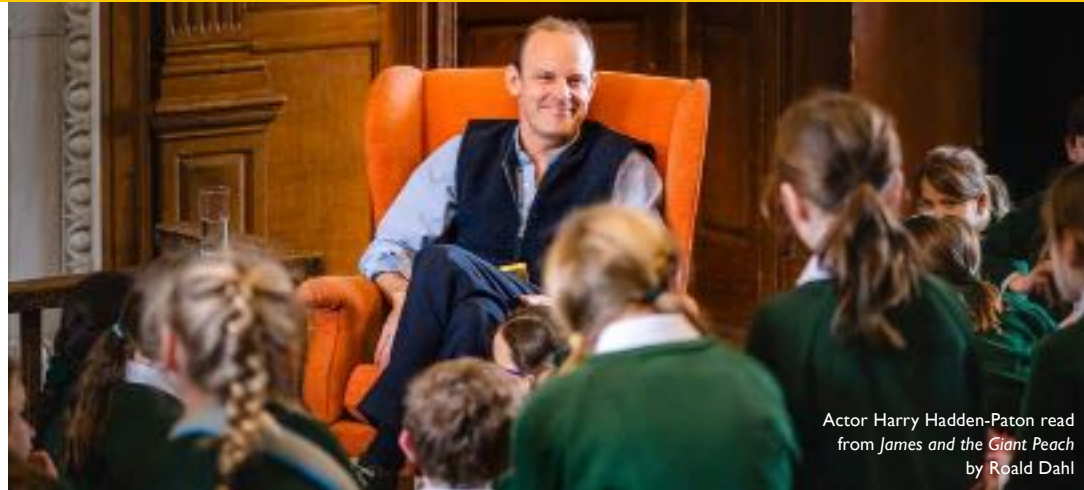
Actor Harry Hadden-Paton read from James and the Giant Peach by Roald Dahl