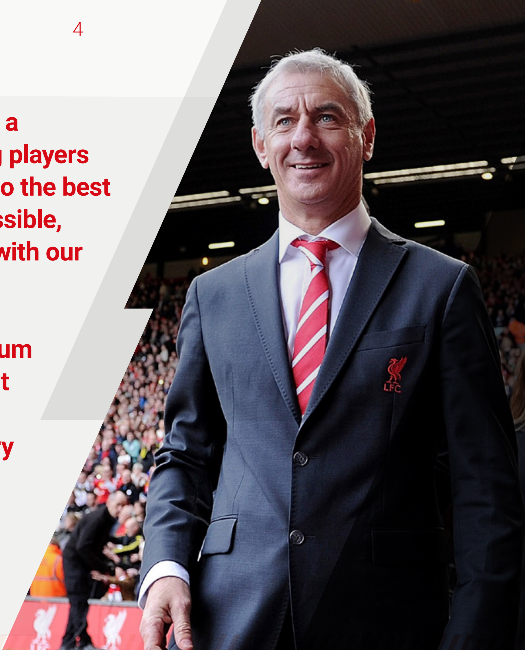
IAN RUSH, LFC LEGEND & AMBASSADOR

By following the same curriculum that we deliver to our players at the LFC Academy we ensure that all participants get the very best football education from our coaching staff.